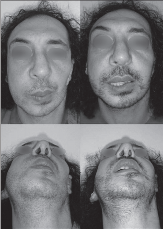
Fig. 3. (Front and inferior view). A 40-year-old man affected by Treacher-Collins syndrome with a severe facial asymmetry even after orthognathic surgery (Patient no. 40). Postsurgical aspect after two structural grafting procedures (follow-up time: 3 months). 20 ml and 14 ml of purified fat tissue were grafted in the left lateral cheek region, chin and nasolabial folds. Even if the post-operative result is still not satisfying, facial symmetry is improved.

oedema from orthognathic surgery has stopped, in order to achieve a more predictable outcome.