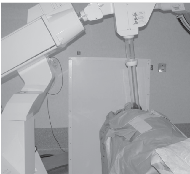
Fig. 1. Mobile accelerator NOVAC7 during the IORT procedure.