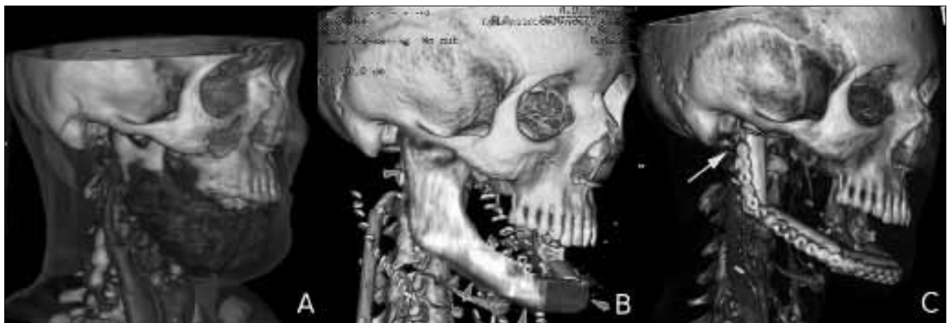
Fig. 1. Case 1. (A) Preoperative 3D-CT scan with window for bone and soft tissues. A bulky tumour involves the whole right mandible and half of the left mandible. (B) 3D-CT scan showing the simulated position of the fibula free flap for reconstruction of the right mandibular body and ramus. (C) Post-operative 3D-CT scan showing mandibular reconstruction with fibula free flap.

Another useful and safe “tip” we adopted is exploiting any periosteal excess in the flap to grant a better blood supply, mostly in the case of planned post-surgical radiotherapy, as suggested by Trignano et al 29 . Obviously, reconstruction of the surgical defect is the most delicate part of the process, and the surgeons’ attention should be addressed to several relevant issues. When using a reconstructive plate, pre-plating is associated with good results, both in the literature and in our experience 30 . Nevertheless, pre-