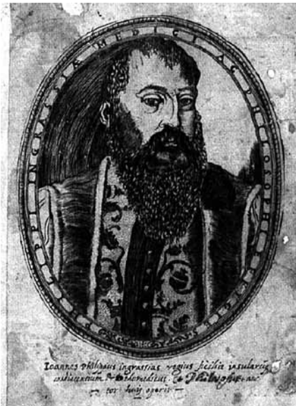
Fig. 1. Portrait of Ingrassia, as reproduced in the book In Galeni librum de ossibus doctissima et expertissima commentaria (see also the shadow in transparency of Fig. 2) (courtesy of Prof. F. Cappello).

Ingrassia added some details to the description of the VIII cranial nerve (V in the ancient Galeno’s classification) and in this description introduces the concept of bone conducting sound: “if one closes the external ear canal [...] keeping between the teeth or accosting near the mouth the hand of a guitar [...] he can hear sound, if after this he turns away the instrument no sound is then perceived” 2 . Although the intuition of the Sicilian physician was brilliant, the mechanism that he thought of was different from the physiologic actual model, as he believed that the VIII nerve directly conducted the sound from the skull bones. However, Ingrassia described in detail the cochlea, the semicircular canals and the stapedius muscle. Also, the first description of the auditory tube, in the opinion of some authors, should be attributed to Ingrassia rather than Eustachio 3,7 , but the evidence for this is not clear. The most important discovery in Ingrassia’s study about the hearing organ was the first description of the third bone of the ossicular chain that he called “stapes”. In this regard, we would like the Sicilian physician to narrate his own story of the discovery. For this, we provide an excerpt from the original version of his scripts: “I want to tell now how this little bone was discovered by me for the first time. In the year of world redemption 1546, while I was teaching in Naples the theory and