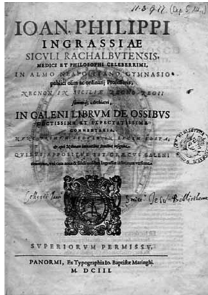
Fig. 2. Inside cover of the book In Galeni librum de ossibus doctissima et expertissima commentaria , published 13 years after Ingrassia’s death.