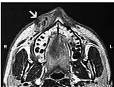
Fig. 3. Coronal T2-weighted MRI revealing a heterogeneous, intramuscular lesion.

upper jaw. Magnetic resonance imaging (MRI) showed heterogeneous, intramuscular lesion at the same location (Fig. 3). The mass was hyperintense to the masseter muscle on T2-weighted images. The imaging findings, history of long duration of the swelling and the clinical finding of discolouration of the overlying skin raised suspicion of a vascular lesion. On that basis, angiography was performed, and the patient underwent bilateral common carotid arteriography via the right femoral artery that confirmed the vascular nature of the lesion. In particular, the right common carotid injection showed that the mass consisted of a collection of tortuous vessels of varying calibre. Two main feeding vessels were detected, one originating from the right facial artery and another from the right internal maxillary artery (Fig. 4). Based on these findings, a provisional diagnosis of intramuscular haemangioma was made and surgery was scheduled. The lesion was removed via an intraoral approach under