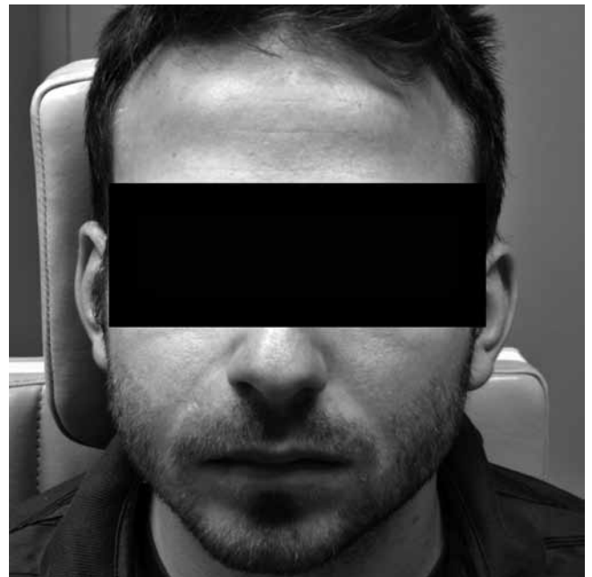
Fig. 5. Appearance of the patient at 6 months after surgical excision of the tumour mass.

Intramuscular haemangioma is an uncommon vascular malformation, accounting for less than 1% of all haemangiomas 1 . It affects mainly the trunk and extremities where the muscle volume is larger. Approximately 13% of these lesions present in the head and neck region 2 . In the head,