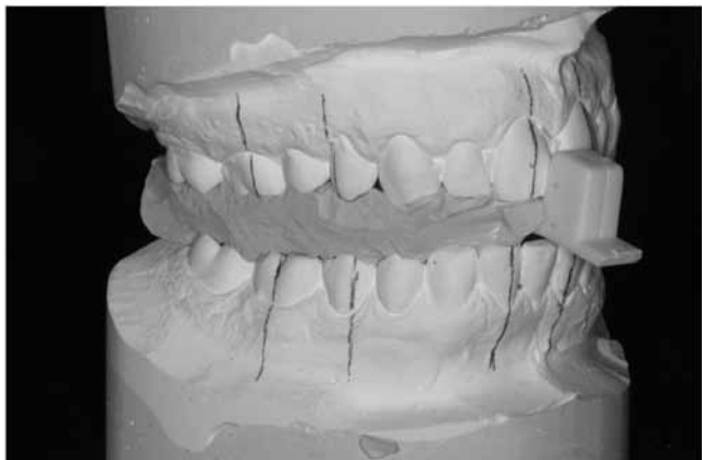
Fig. 3. The 5 mm George Gauge bite fork.