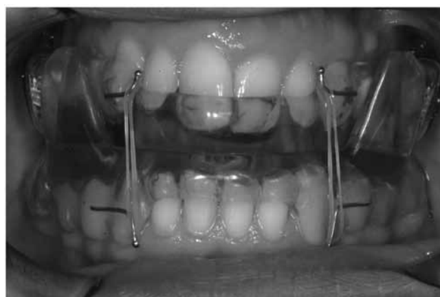
Fig. 5. Intraoral vertical elastics.