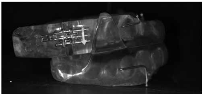
Fig. 1. Somnodent ® MAS: frontal view.