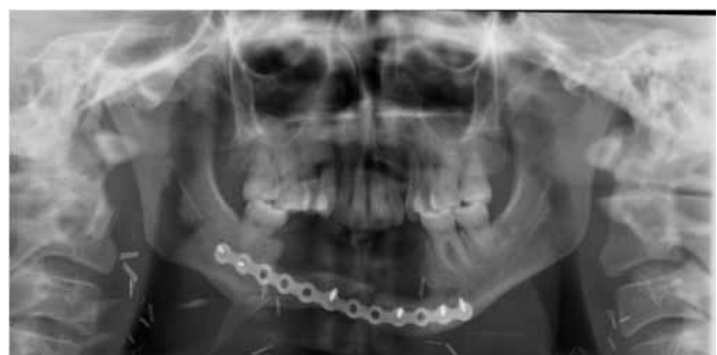
Fig. 1. Orthopantomography showing free fibula pedicle ossification of a young patient treated for oral squamous cell carcinoma.

Asymptomatic patients were also followed up. In the second group of 20 patients, we performed dissection of the periosteum from the vascular pedicle. In this group, to date, no pedicle ossification has been observed. Univariate analysis showed a statistically significant difference ( p < 0.05 ) between the two study groups. No significant increase in operative time was noted, and additional complications were not observed.