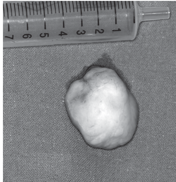
Fig. 2. Excisional biopsy specimen of a whitish mass measuring 3-4 cm in diameter.

Nasopharyngeal angiofibroma is a well-defined entity sharply localized in time, space, and sex. The tumour virtually always arises from the nasopharynx and only later may extend into the nasal cavity 10 . More recently, the term extranasopharyngeal angiofibroma has been applied to vas-