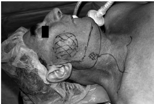
Fig. 3. Pre-operative image of mass in right parotid gland.

Inferior right facial weakness remained but no other post-operative complication occurred.