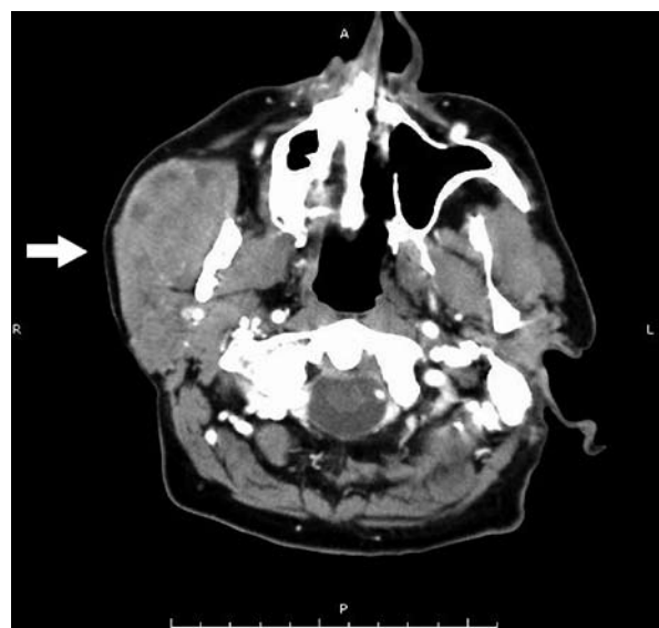
Fig. 1. Computed tomography scan revealing enhancing mass in parotid gland with extension to masseter muscle.

Metastatic work-up, by total-body 6FDG-PET, was com-