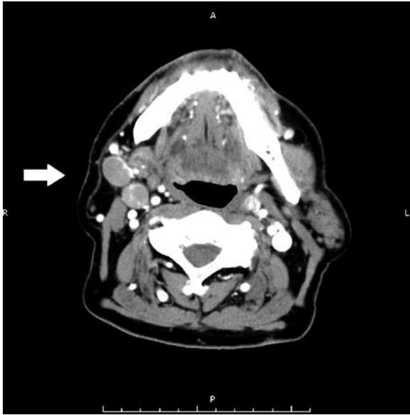
Fig. 2. Computed tomography scan showing highly suspicious neck lymph nodes.

pletely negative, except for the parotid gland and neck.