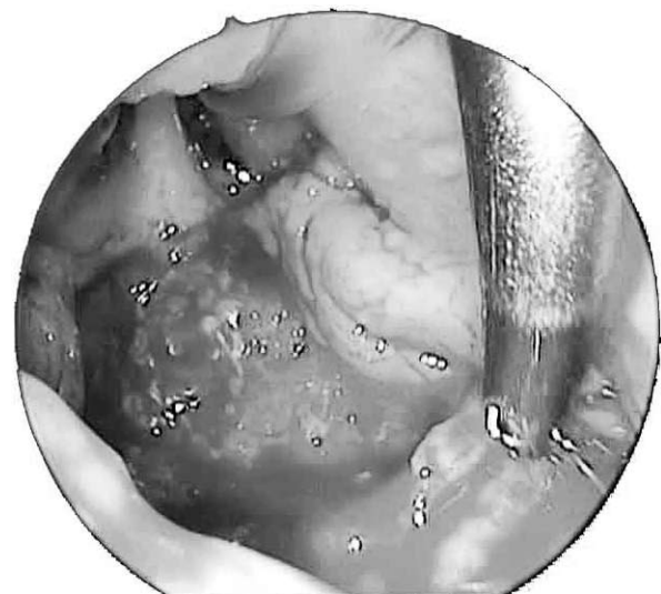
Fig. 3. View of nasopharynx at the end of surgery.