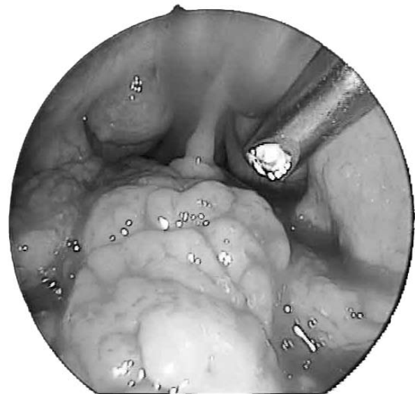
Fig. 2. View of nasopharynx through the 70° endoscope.