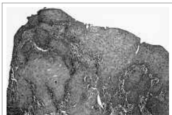
Fig. 1. Squamous differentiation of neoplasm (H&E; X100).

mour consisted (70%) of a moderately differentiated squamous cell carcinoma (Fig. 1) and of moderately differentiated glandular proliferation with foci of squamous cell proliferation (30%) (Fig. 2). The examination of cervical lymph nodes was negative. No post-operative complications occurred.