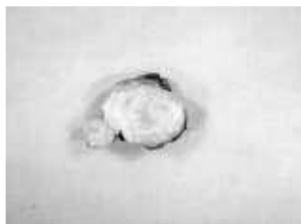
Fig. 2. Macroscopic characteristics.