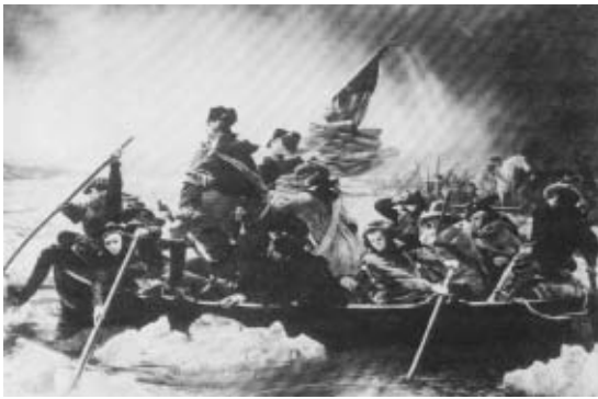
Fig. 3. The Americans guided by Washington cross the Delaware during the night of 25 December 1776 (painting by Emanuel Leutze, New York, Metropolitan Museum of Art).