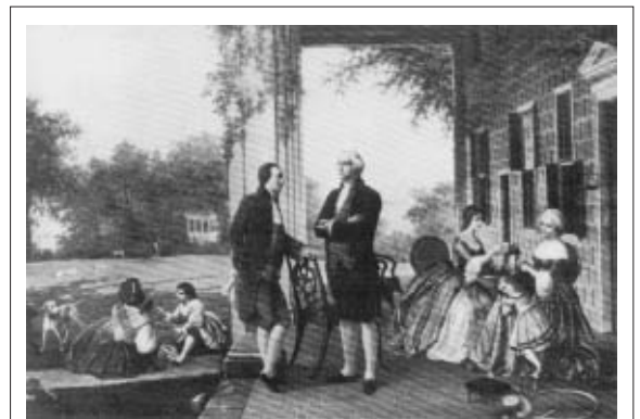
Fig. 2. George Washington on the veranda of his home in Virginia, together with the Marquis Lafayette (from: Storia dei popoli e delle civiltà . Turin: UTET; 1974;vol.XVI).

activities, albeit dedicating his interests also to agriculture, in which he achieved excellent merits. In 1774, he took part in the movement towards independence of the American States, through military actions, coordinated with political affairs which led to his fame as a great leader (Figs. 3, 4). Following the difficult victory against the English at Monmouth (1778), the endeavours of the General for independence became more and more important. In 1783, having made peace with the English, he left the command in the hands of Congress. In 1786, he was elected President of the constitutional Convention of Philadelphia which drew up the text of the American Constitution. As far as concerns the work involved in the Convention and the text of the Constitution, Washington had a very strong influence, conferring great power upon the President's figure, which, at the time, represented a definite guarantee of strength for the Confederation (Fig. 5). Elected the first President of the Union, he came to power on 30th April, 1789 and governed with a great sense of responsibility. He was re-elected in 1792 for a further four years. Dur-