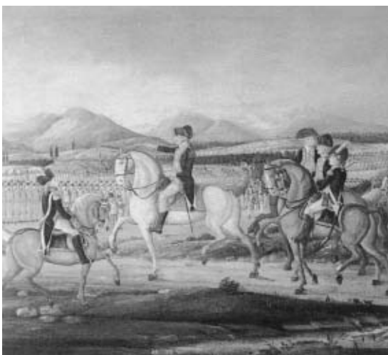
Fig. 4. Washington inspects the Eastern forces at Fort Cumberland (painting attributed to James Peale. New York, Metropolitan Museum of Art).

ing his second term of office, strong reactions were manifested by the radicals on account of Washington's pro-English attitude which led to a severe crisis at executive level, with some ministers standing down. In 1796, at the end of his term of office he decided not to stand again for re-election, publishing a farewell message to the American nation, which has remained famous, and he retired to his farmland in Mount Vernon, Virginia where he died on 14th December 1799, following an acute disease lasting only 21 hours.