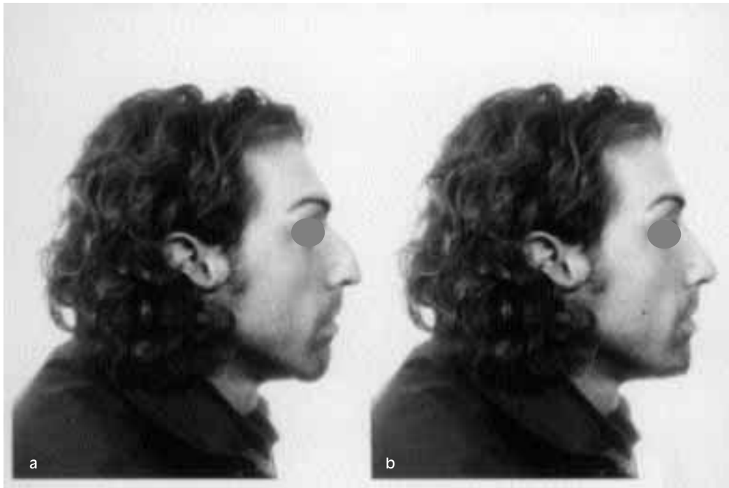
Fig. 4a, b. Pre-operative image (a) of patient with post-traumatic nasal deformity associated with presence of osteocartilaginous hump and prognathism. Digital modelling (b) of nose and mandibular profile.

However, in the event of litigation, this sort of conduct may lead to the suspicion of malpractice and of conduct, not in accordance with the state of the art. It is certainly advisable to keep the processed images, perhaps digitally authenticated, together with the consent, signed by the patient 8 . It should not be forgotten that in many countries, including the United States, images are an integral part of the clinical record.